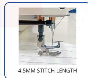
4.5MM STITCH LENGTH