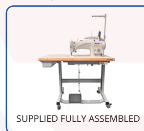
SUPPLIED FULLY ASSEMBLED